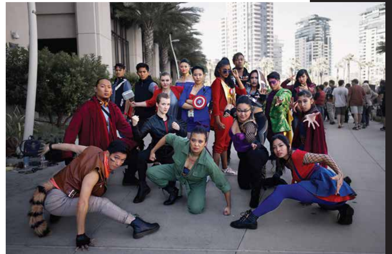
Idol Scouts (Ronin Expo '18)