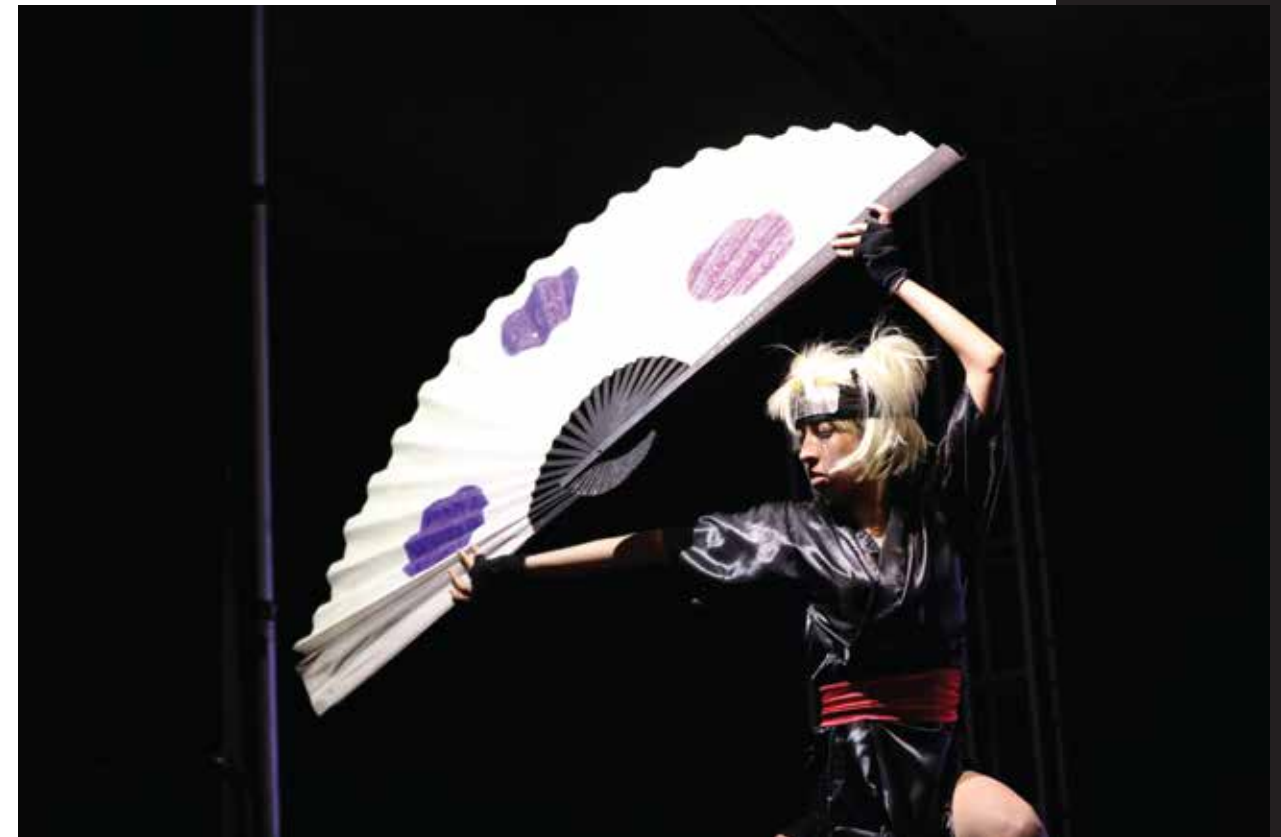
Bleach (Across the Multiverse at Ronin Expo '19)