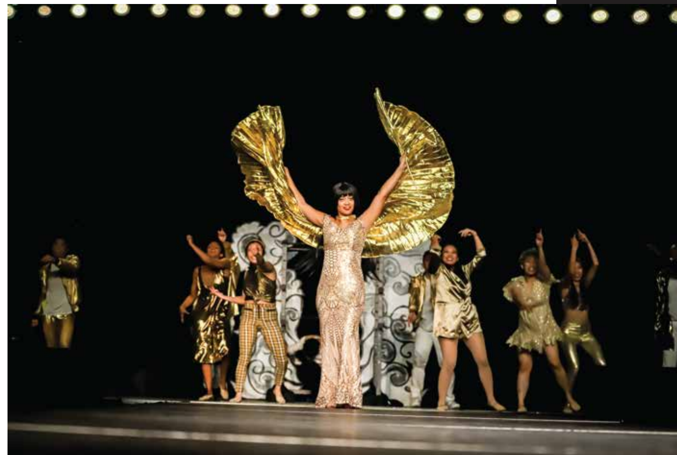
Across the Multiverse (Anime Los Angeles '20)